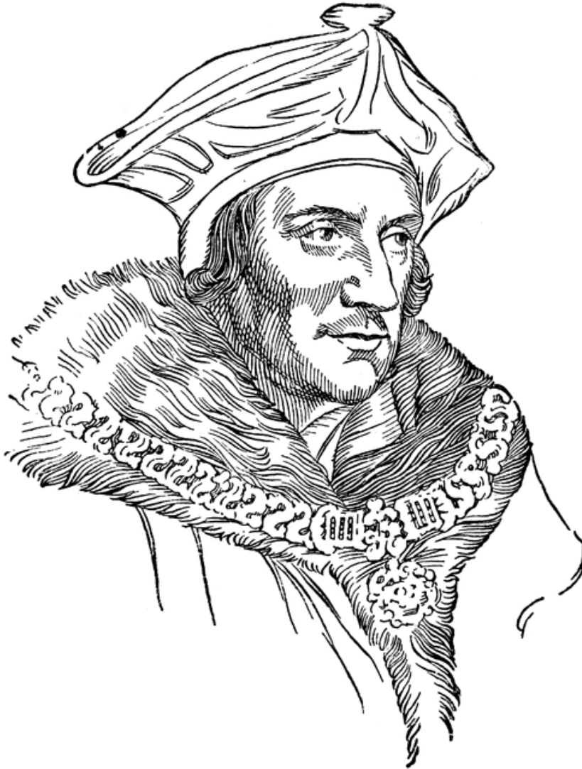
St Thomas More: Patron of STM Parish